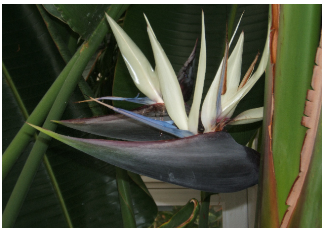
Giant White Bird of Paradise

Due to greenhouse maintenance work now in progress, a start date for the February opening will be dependent on completion of the maintenance project. Watch for news in the media about our reopening or call 245-3288 to hear the recorded message with current status of hours.